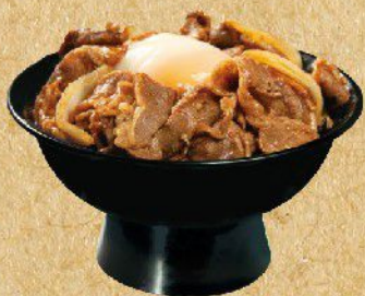
A 溫泉玉子蒜香牛肉飯 Half Boiled Egg & Garlic Beef Rice Bowl