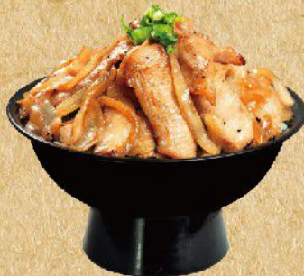
B 生薑豬頸肉飯 Pork Cheek with Ginger Rice Bowl