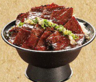
D 牛角燒牛肉飯 Gyu-Kaku Yakiniku Beef Rice Bowl