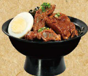
C 玉子汁煮豬軟骨飯 Egg & Pork Cartilage Rice Bowl