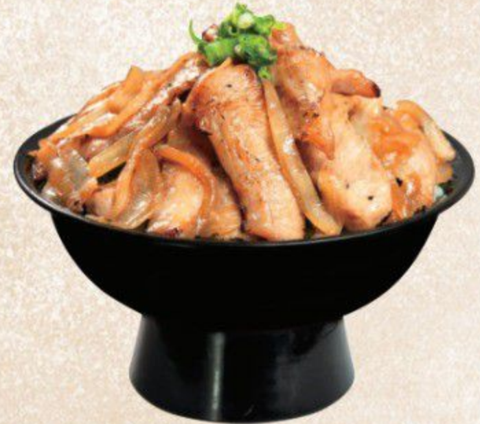
B 生薑豬頸肉飯 Pork Cheek with Ginger Rice Bowl