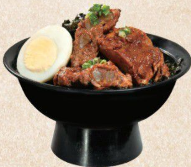
C 玉子汁煮豬軟骨飯 Egg & Pork Cartilage Rice Bowl