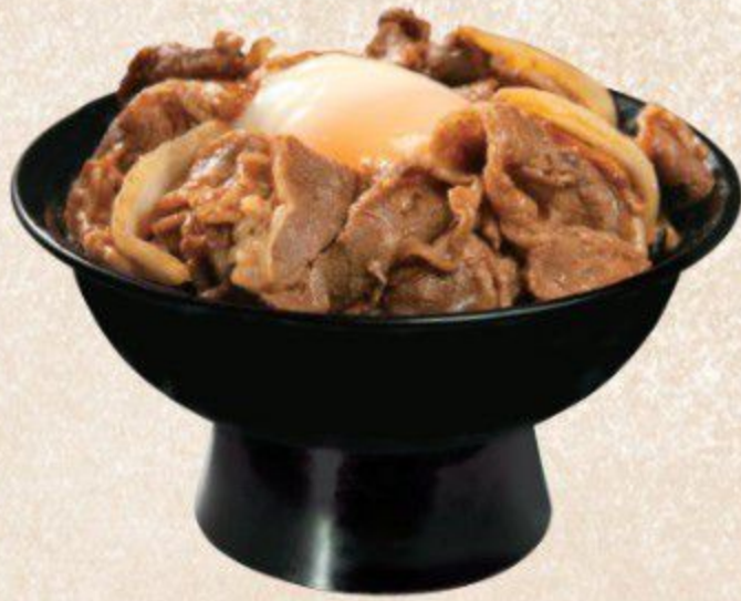
A 溫泉玉子蒜香牛肉飯 Half Boiled Egg & Garlic Beef Rice Bowl