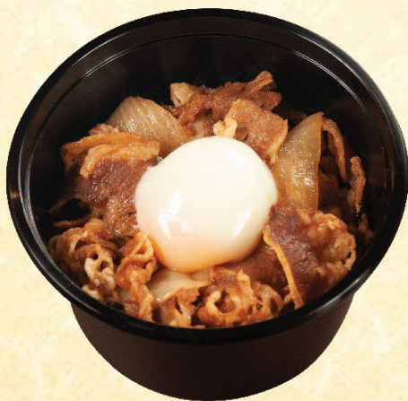
A 溫泉玉子蒜香牛肉丼 Half Boiled Egg & Garlic Beef Rice Bowl $62