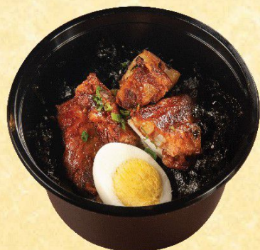
C 玉子汁煮豬軟骨丼 Egg & Pork Cartilage Rice Bowl $59