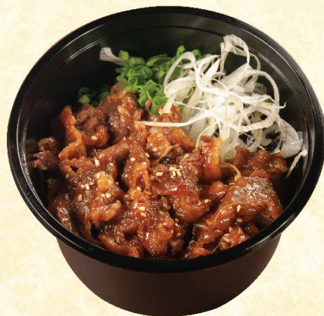
B 牛角流薄燒牛胸腹丼 Teriyaki Beef Short Plate Rice Bowl $72