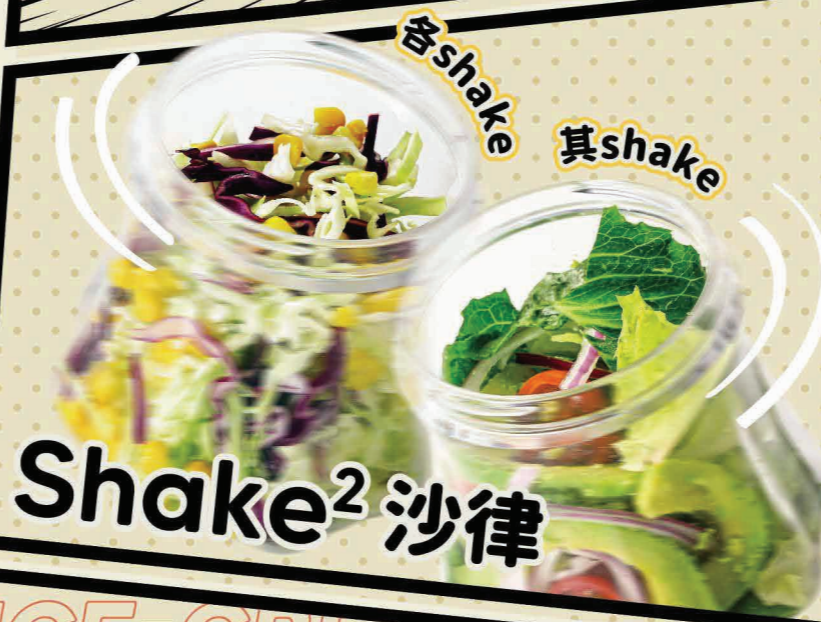
Shake 2 沙律